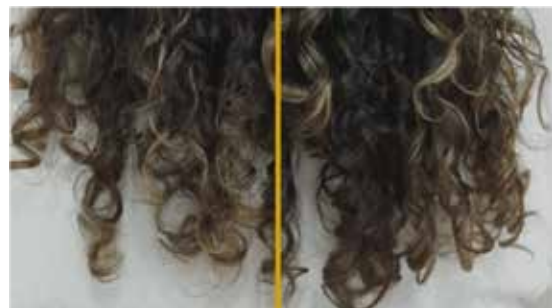
Without Fiber.CARE X