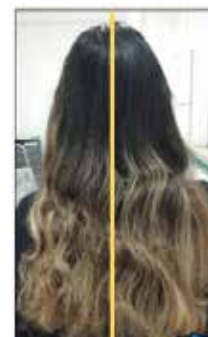
72 hours after washing

Excellent results in several hair types and conditions!