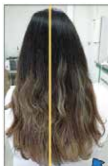
24 hours after washing