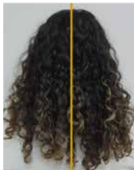
7 hours after washing