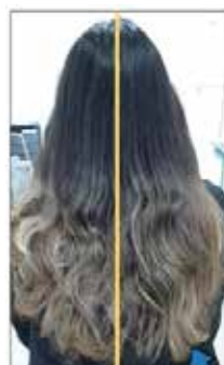
48 hours after washing